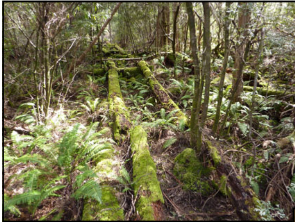
Old Tramline seen during field trip to the Mt Barrow Discovery Trail