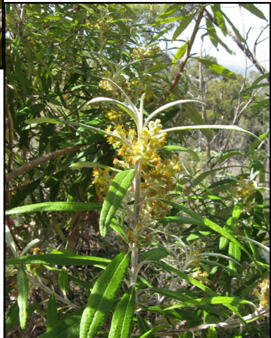
Bedfordia at Mt Cameron during Federation Weekend