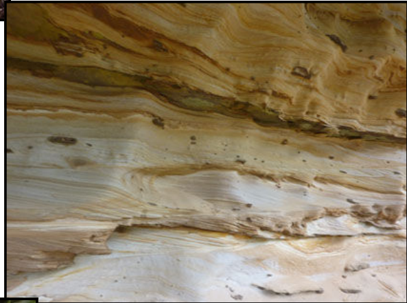
There were many sandstone cliffs in the gorge at Bluff River near Buckland