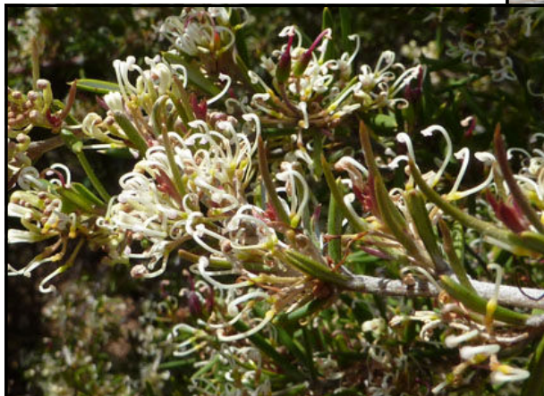
Grevillea at Bushland Gardens near Buckland